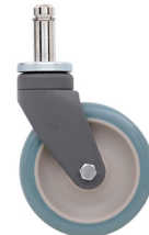
5PCXM Antimicrobial Tread Swivel