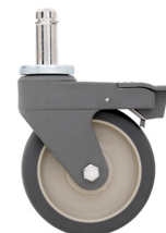
5PCBX Swivel & Brake