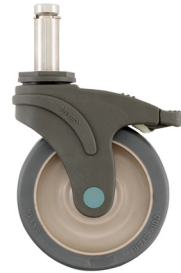
5PSTEBX Total Lock